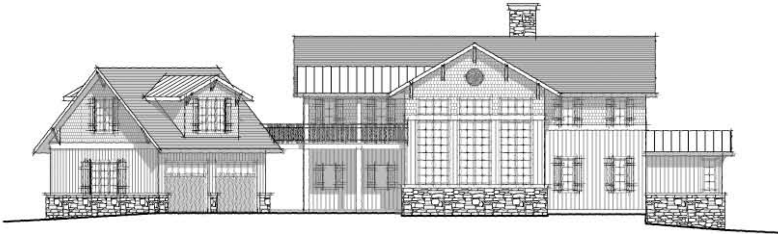
Bonus Room 435 Square Feet